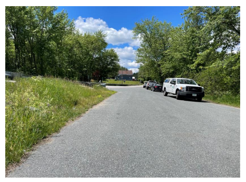
Johns River Boat Launch staging area looking toward Dalton Rd/RT 135 (June 2021)